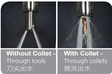
Without Collet - Through tools 刀尖出水